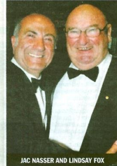
JAC NASSER AND LINDSAY FOX