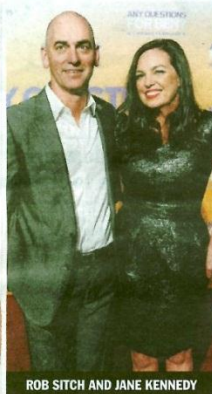
ROB SITCH AND JANE KENNEDY