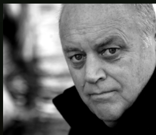
Robert Drewe, Author

Robert Drewe grew up on the West Australian coast, the setting for his best-selling memoir, The Shark Net . His many novels, including The Drowner , Our Sunshine , Grace and Fortune , and his short-story collections, The Bodysurfers and The Bay of Contented Men , have been widely translated, won national and international prizes, and been adapted for film, television, radio and the theatre around the world. The Drowner made Australian literary history by winning the Premiers' literary awards in every State, as well as the Adelaide Festival Prize. Our Sunshine , an imaginary life of Ned Kelly, was made into the international film Ned Kelly , starring Heath Ledger, Orlando Bloom and Naomi Watts, while The Shark Net and The Bodysurfers were adapted for ABC and BBC television mini-series. His latest book, The Rip , has just been published by Hamish Hamilton/Penguin.